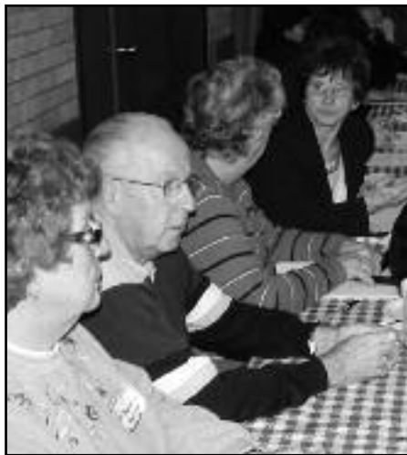
Congress Day in Kindersley.

The Saturday morning sessions began with information and feedback about the upcoming new English translation of prayers for the Mass, soon to be released, along with the revision of the General Instruction for the Roman Missal (GIRM).