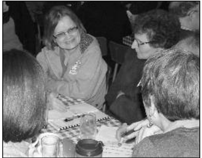
Parishioners from the Kerrobert and Eatonian deaneries gathered at St. Joseph parish in Kindersley for the Congress Day Jan. 15.

Another portion of the Congress Day introduced the diocesan policy for the protection of children, youth and other vulnerable persons from all kinds of abuse: sexual, physical, emotional, financial. The policy has existed in the diocese for nearly 20