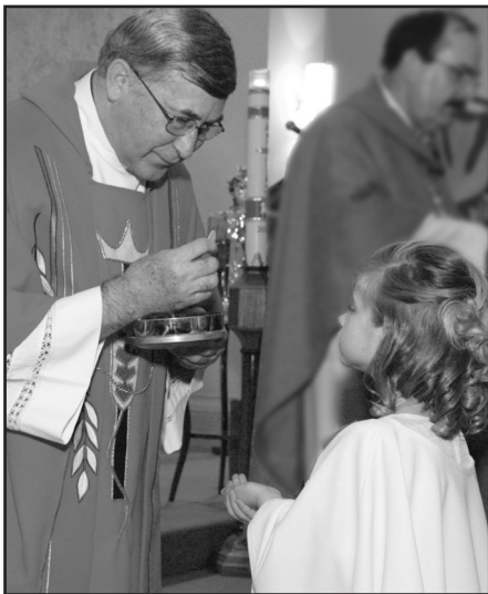
Reconciliation and confirmation are celebrated before first Eucharist in the Roman Catholic Diocese of Saskatoon.

Celebration of the sacrament of first reconciliation has been in transition