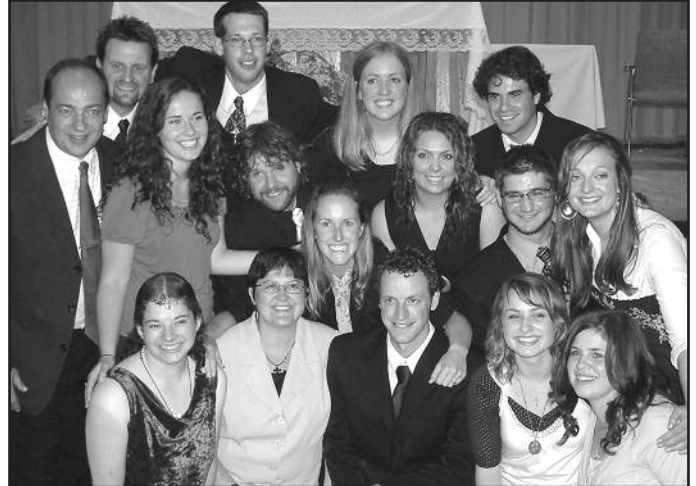
A commissioning celebration was held in June for this inaugural class of St. Therese School at Bruno. A new class began a program of formation in September.

For details on upcoming events, visit the website, www.sttherese.ca , sign up for an e-mail list, or contact us at (306)369-2555 for more information.