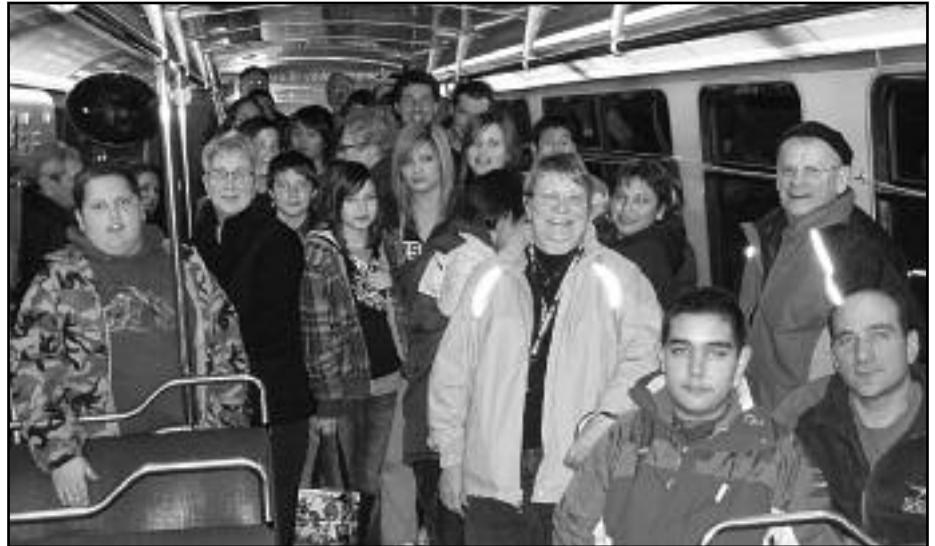
Children and volunteers from St. Mary's recently travelled to a hockey game.