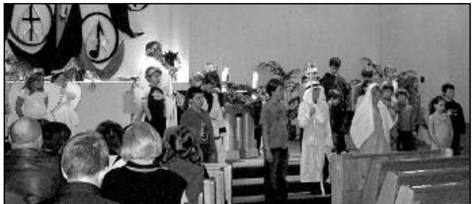
A special advent program was held this year at Sacred Heart parish in Denzil.