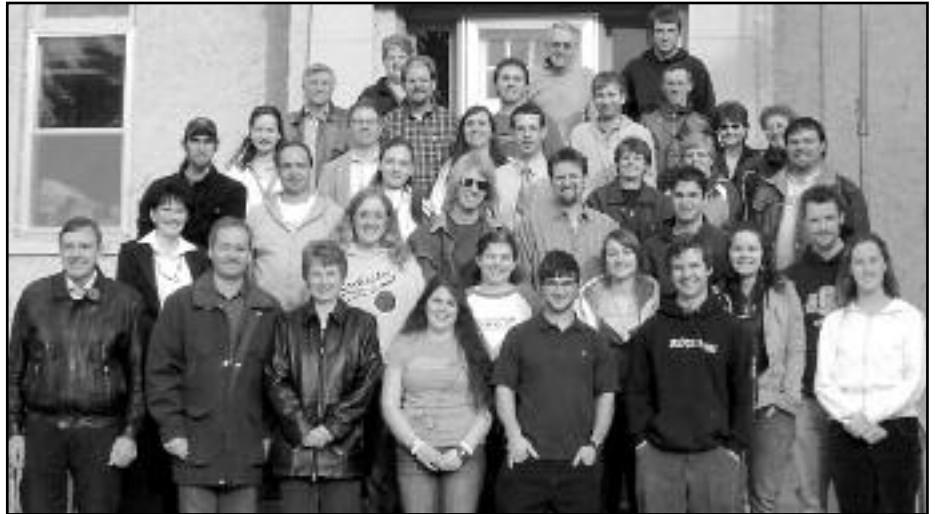
Students and staff at St. Therese Catholic College of Faith and Mission in Bruno.