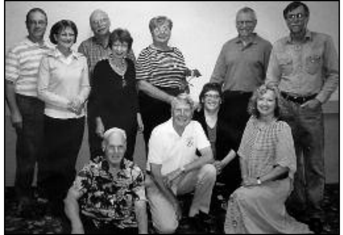
Leaders of Retrouvaille Saskatchewan, which is now offering weekend programs.

"Most couples (who attend the weekend) are in a state of despair and hopelessness when they attend the program. The weekend is not a 'miracle cure' ...we encourage one another to put