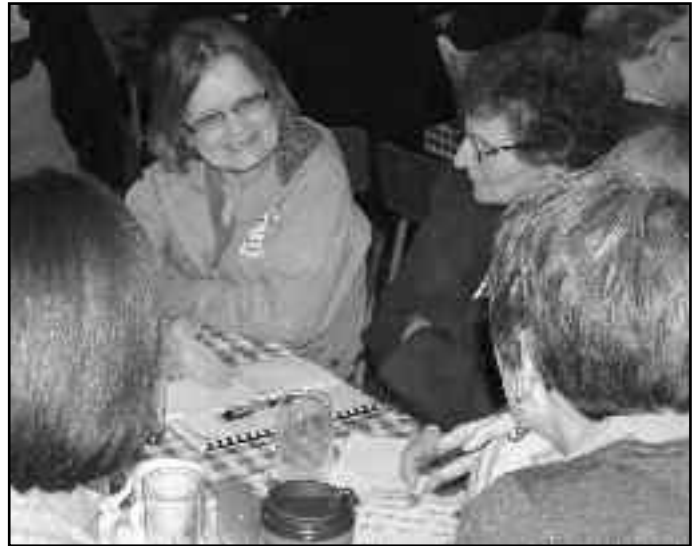
Parishioners from the Kerrobert and Eatonian deaneries gathered at St. Joseph parish in Kindersley for the Congress Day Jan. 15.

Another portion of the Congress Day introduced the diocesan policy for the protection of children, youth and other vulnerable persons from all kinds of abuse: sexual, physical, emotional, financial. The policy has existed in the diocese for nearly 20