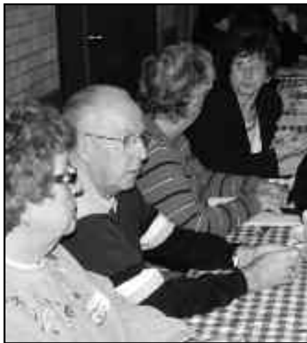
Congress Day in Kindersley.

The Saturday morning sessions began with information and feedback about the upcoming new English translation of prayers for the Mass, soon to be released, along with the revision of the General Instruction for the Roman Missal (GIRM).